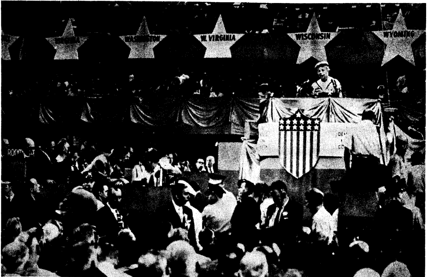
Mrs. Roosevelt addresses the Democratic Convention at Chicago.