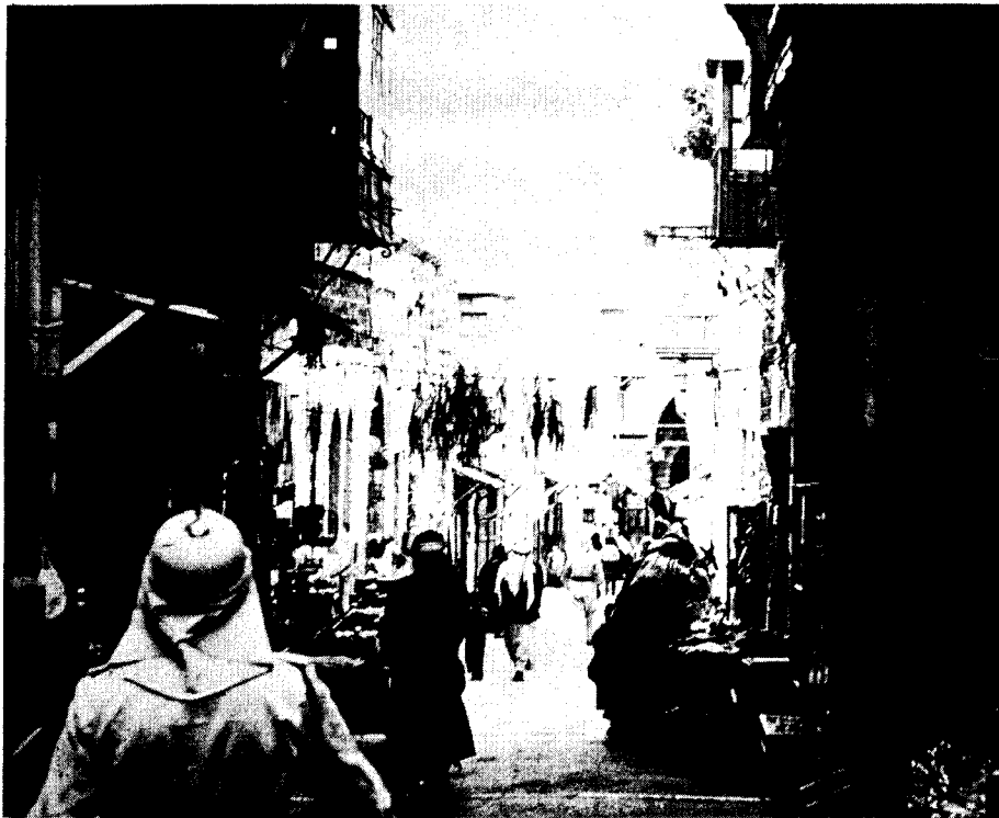
A typical street scene in the Arab Section of Old Jerusalem.

After leaving the mosque we were taken to the market, or Bazar (as they are called there). There were narrow, dirty streets packed with dirty people—all Arabs in dirty robes. There were open shops on both sides of the streets. A number of times in the crowd we were